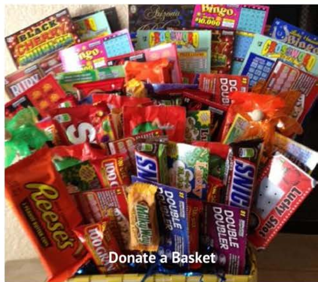
Donate a Basket