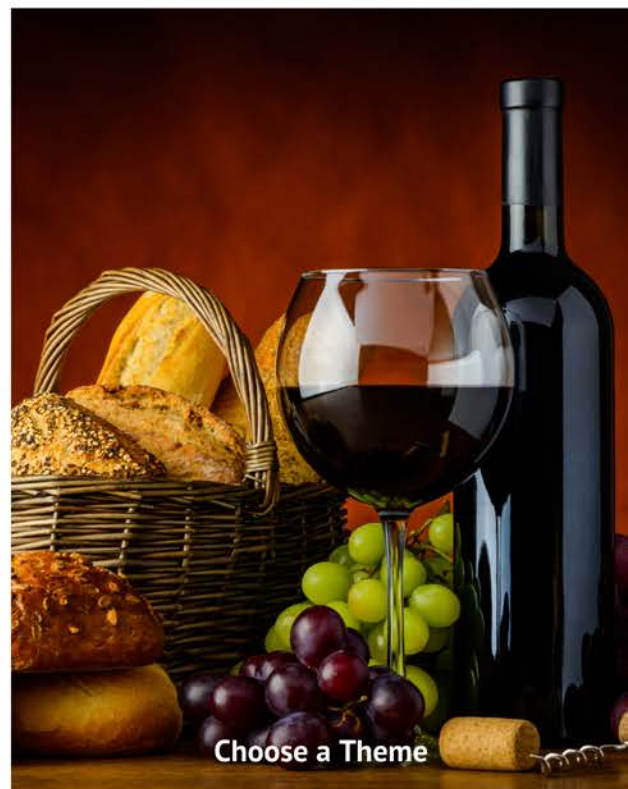
Choose a Theme