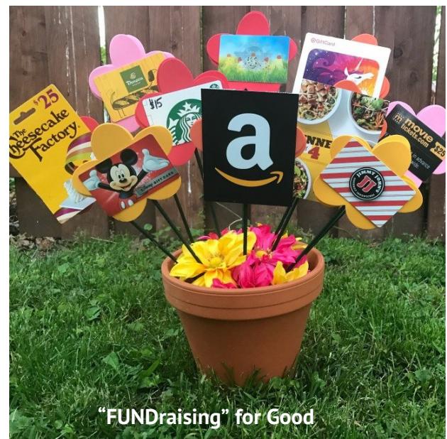
"FUNdraising" for Good