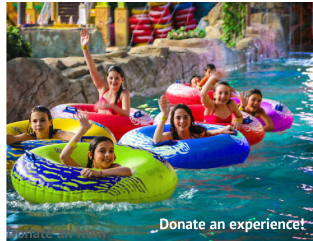
Donate an experience!